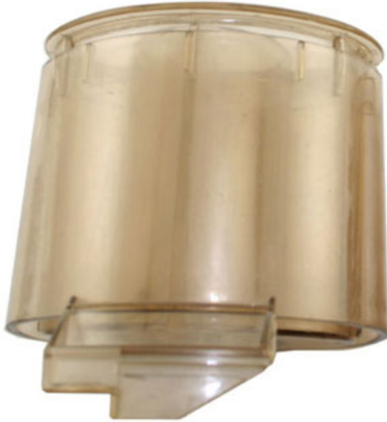
No Vertical Tabs