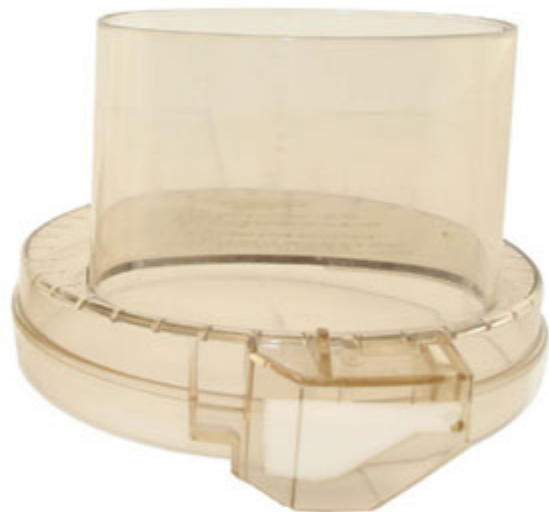
White plastic activator tab.